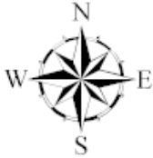
Figure 4 Bainbridge Island Watersheds