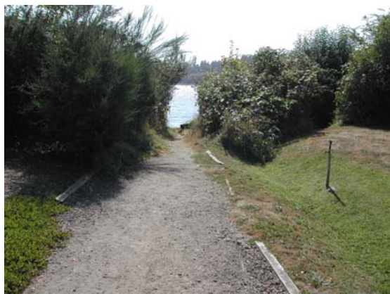
View from site.

This trail is a public access easement provided by Eagle Harbor Condominiums.